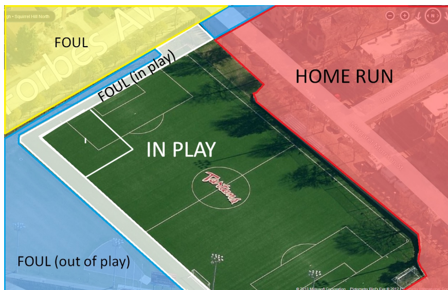
Figure 4: Field B.

plate and 60 feet from first and third base. The pitchers mound will be directly in between first and third base and in line with home and second base. Note that