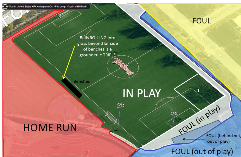
Figure 2: Field A.