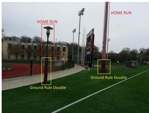
Figure 1: Ground rules for poles.