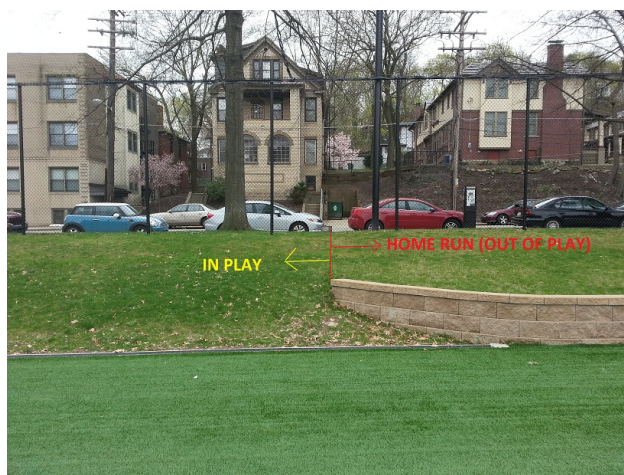
Figure 6: Field B - Showing in and out of play regions in left field.