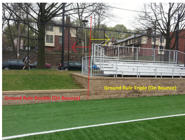
Figure 5: Ground rule double versus ground rule triple on Field B. Note that anything over the brick walls on the fly is a home run.