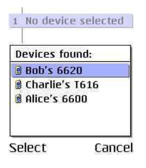
(a) Device selection.

On the Nokia 6600, SiB is able to process two to three barcode snapshots per second. We have successfully read in excess of five barcodes from a single snapshot, for a sustainable rate averaging 10 to 15 barcodes per second under ordinary office lighting conditions (see Figure 6).