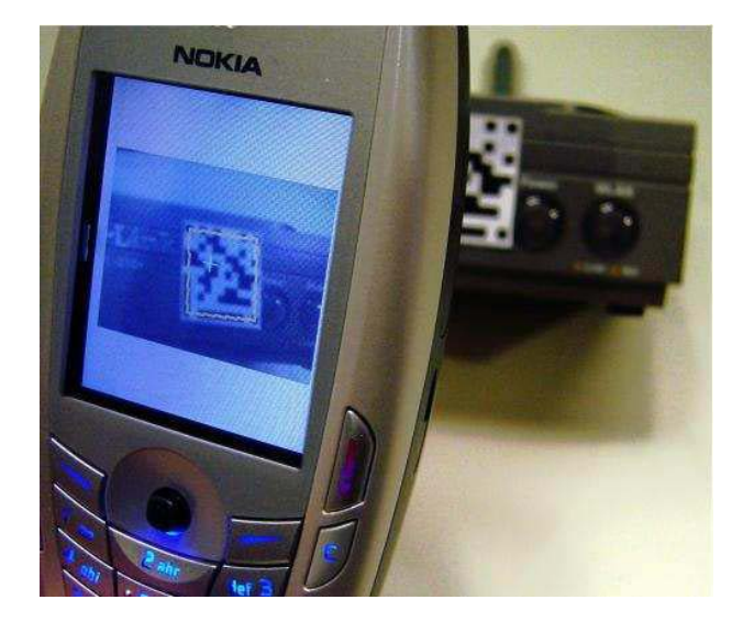
Figure 3. Phone running SiB scanning a barcode on an 802.11 access point.

Another commonly considered application where demonstrative identification of communicating devices is desirable is when using a printer in a public place. Similar to the wireless access point, the printer can have a barcode affixed to its housing so that a user can use SiB to authenticate wireless communication with the printer/print server and bootstrap establishment of a secure connection. Secure communication is important here not only to ensure the secrecy of the printed document, but to protect the user's computer from malicious software that masquerades as a printer driver.