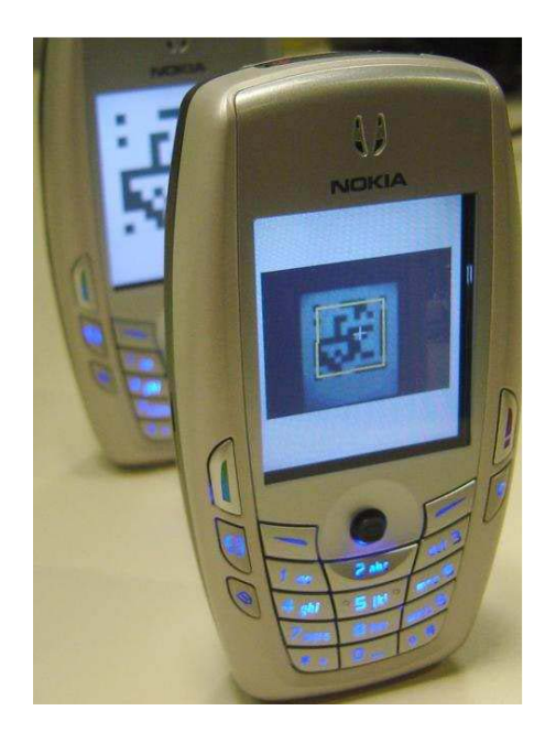
Figure 4. SiB application on a Nokia 6620 with one phone scanning the hash-barcode on the LCD of another.

For example, a 1024 bit RSA key would need to be encoded in 16 barcodes in our current implementation—64 bits of key and 4 bits of place-marker in each barcode.