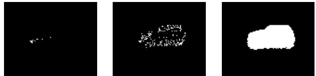
Fig. 4. Three stages of the relaxation process for the video sequence illustrated in Fig. 3. The final estimate of the moving object template is on the rightmost image.