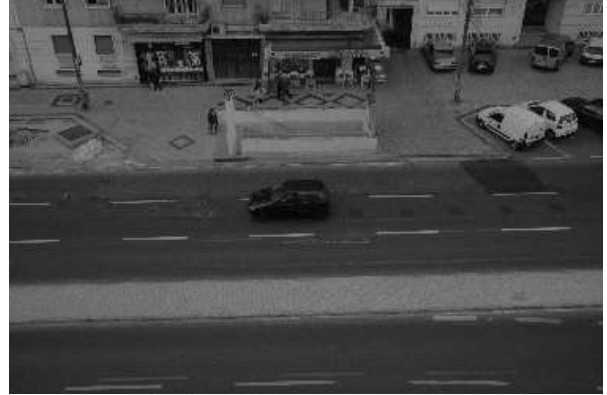
Fig. 3. Low-light scenes lead to video sequences with very low contrast between moving objects and background.